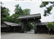
Kyoto Imperial Palace Park