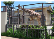
Kyoto City Zoo