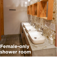
Female-only shower room