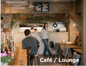
Café / Lounge